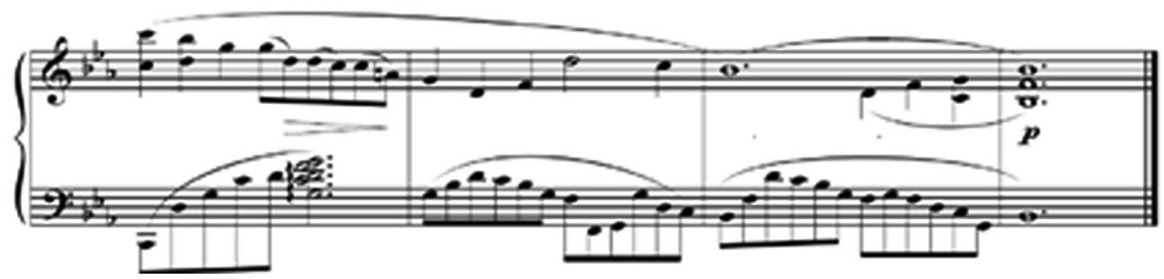
Figure 3: Variation No. 1. Source: (Chu, 2010)