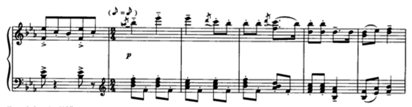
Figure 9: Guessing Riddles.

Chu Wanghua's design of accompaniment patterns for folk song melodies provides rich and sensible information for impromptu accompaniment teaching. In teaching impromptu accompaniment, teachers can lead students to analyse these piano pieces and the design methods of accompaniment patterns in these piano pieces. Meanwhile, students can learn various accompaniment styles by playing these successful examples of adapted music (Cai, 2014).