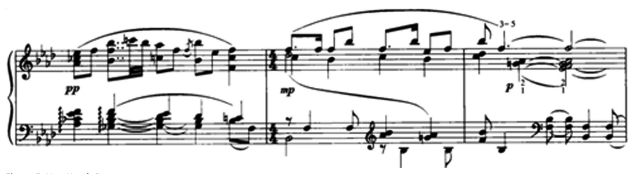
Figure 5: New Year's Day.

ask students to recite these melodies skilfully to broaden their vision, become familiar with the pentatonic style of Chinese folk music, and accumulate materials for the accompaniment of folk songs.