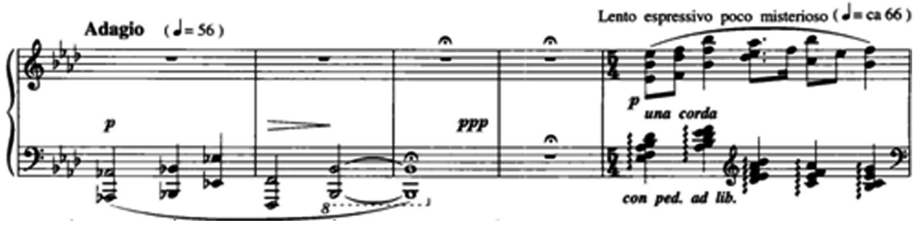
Figure 7: New Year's Day.