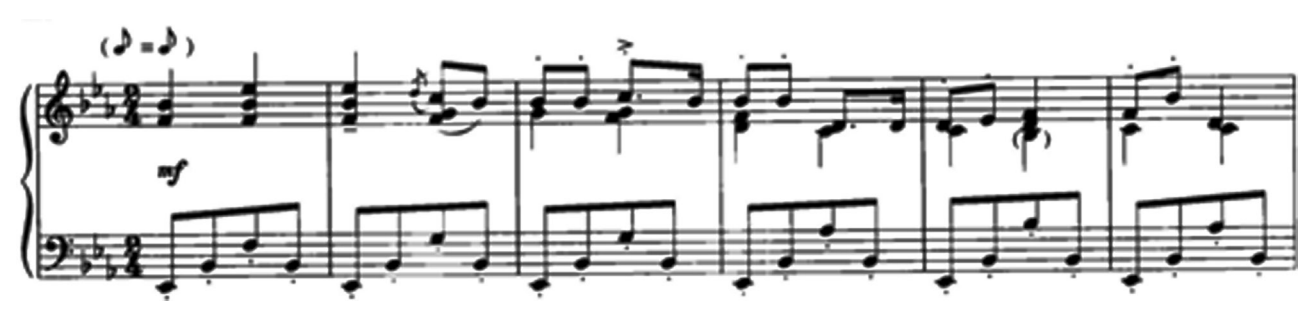
Figure 10: Guessing Riddles. Source: (Chu. 2010)