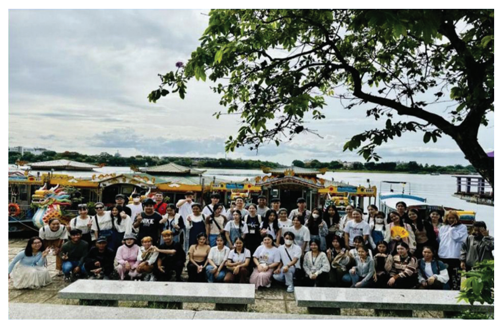
Figure 3. Lao lecturers and students pose for souvenir photos at Toa Kham Wharf in Hue City, Thua Thien Hue Province, Vietnam, following the Flower Lantern Releasing Ceremony on the Perfume River.

With the development of technology, multimedia tools have become indispensable in language teaching. Videos, podcasts, and interactive applications can be used to introduce learners to authentic Vietnamese communication styles. For example, watching Vietnamese TV shows or movies allows learners to observe how native speakers interact in various social contexts, such as formal meetings or casual conversations with friends. According to Tran (2019), multimedia tools not only improve language comprehension but also provide learners with a deeper understanding of cultural nuances. These tools allow learners to interact with the language in a dynamic and engaging way, improving both listening and speaking skills.