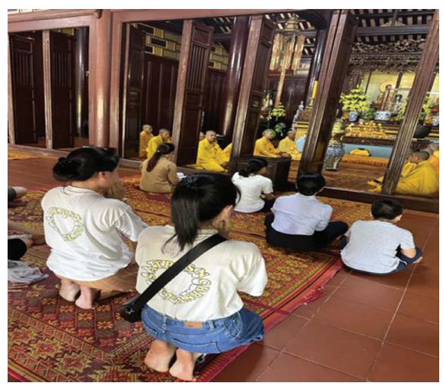
Figure 2. Prayer ceremony of Lao students at Thien Mu Pagoda in Hue City, Thua Thien Hue Province, Vietnam

An effective example of fostering language communication in the classroom involves engaging students in group or pair communication activities centered on the topic of "Traffic." In this approach, the teacher facilitates activities such as identifying modes of transportation using visual aids like pictures or model toys,