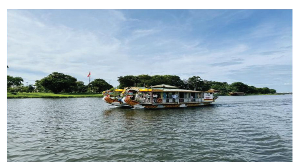
Figure 1. Enjoying a Dragon Boat Cruise along the serene Perfume River

Role-playing and simulation are excellent strategies for improving intercultural communication skills. These methods allow learners to practice speaking Vietnamese in culturally relevant situations. For example, a role-playing