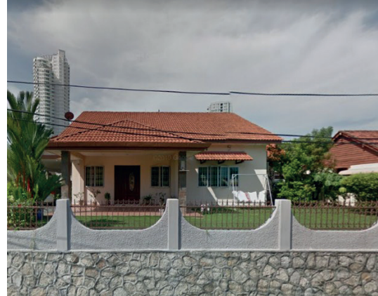
Figure 1: The site map of Kampung Kastam (left) and a typical single-storey house

neighbourhood established to accommodate employees in the early 1960s. Numerous government quarters in this area are now vacant. Landed houses within Kampung Kastam are typically two-storey, but several are single-storey. Figure 1 shows the site map (left) and a typical single-storey house (right) in the study area.